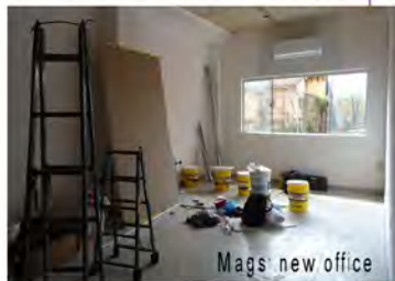
Mags' new office

It's back to school now and we'll get to see the building work as it should be almost finished now. It was looking good as we finished . Apparently they are still doing the final touches.