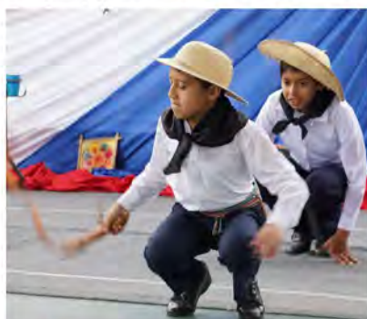
Folklore at the Annexe