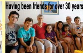
Having been friends for over 30 years.