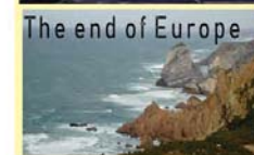
The end of Europe